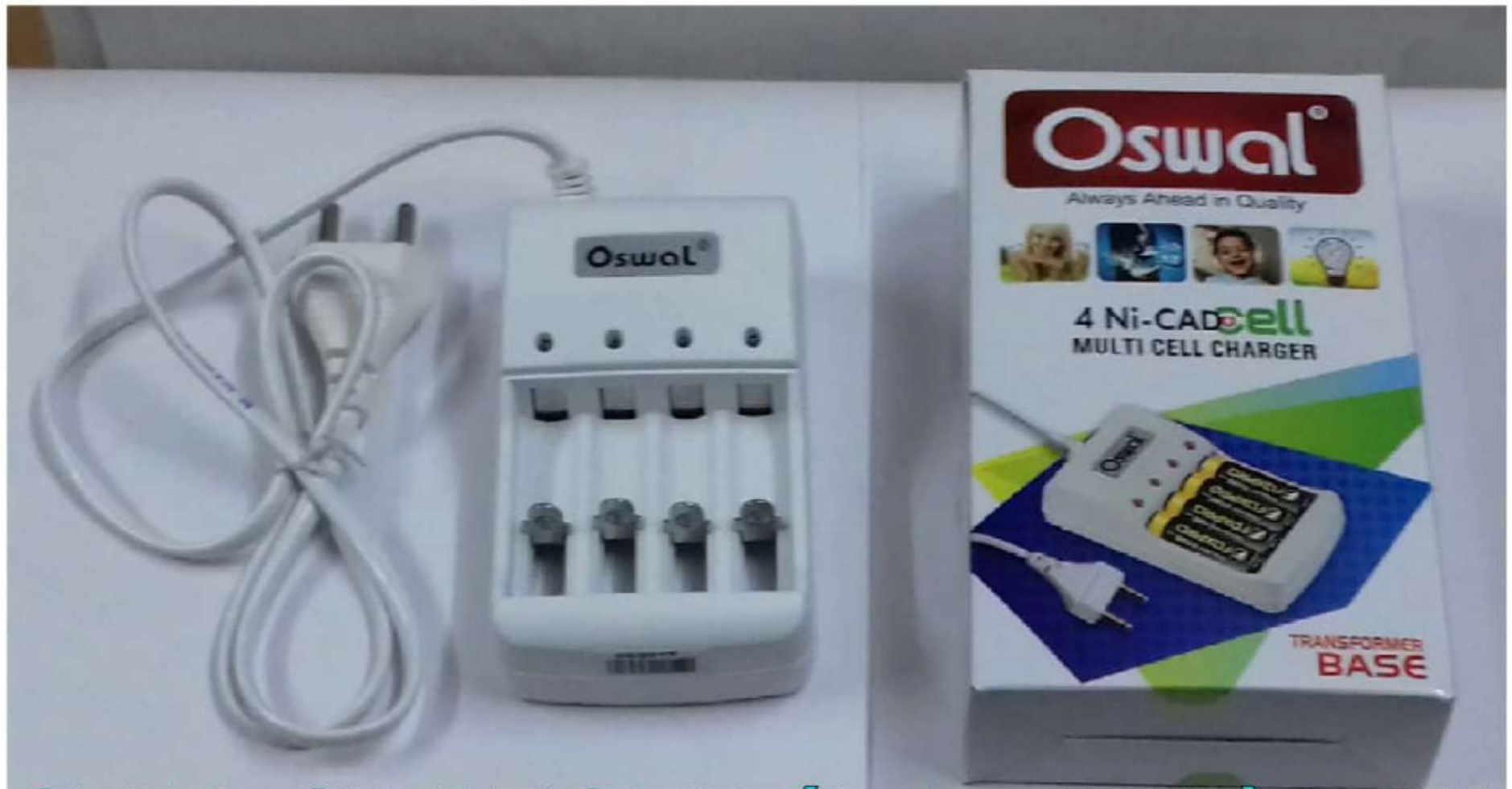
CELL CHARGER (AA+ AAA) DLX