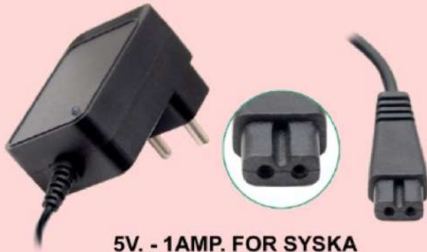
5V. - 1AMP. FOR SYSKA