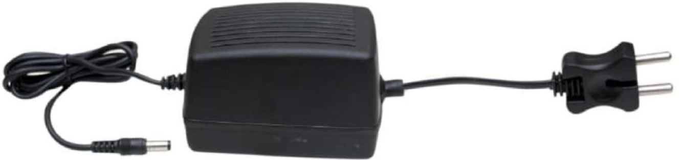
12 V - 2.9 AMP (CREATIVE SPK)