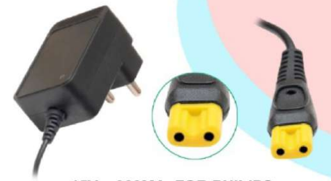
15V. - 360MA. FOR PHILIPS