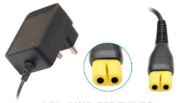
4.3V. - 70MA. FOR PHILIPS