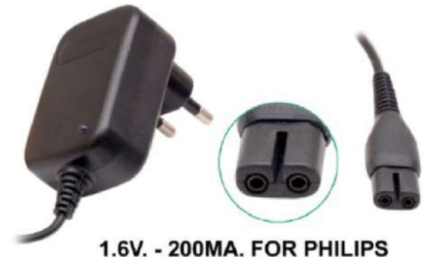
1.6V. - 200MA. FOR PHILIPS