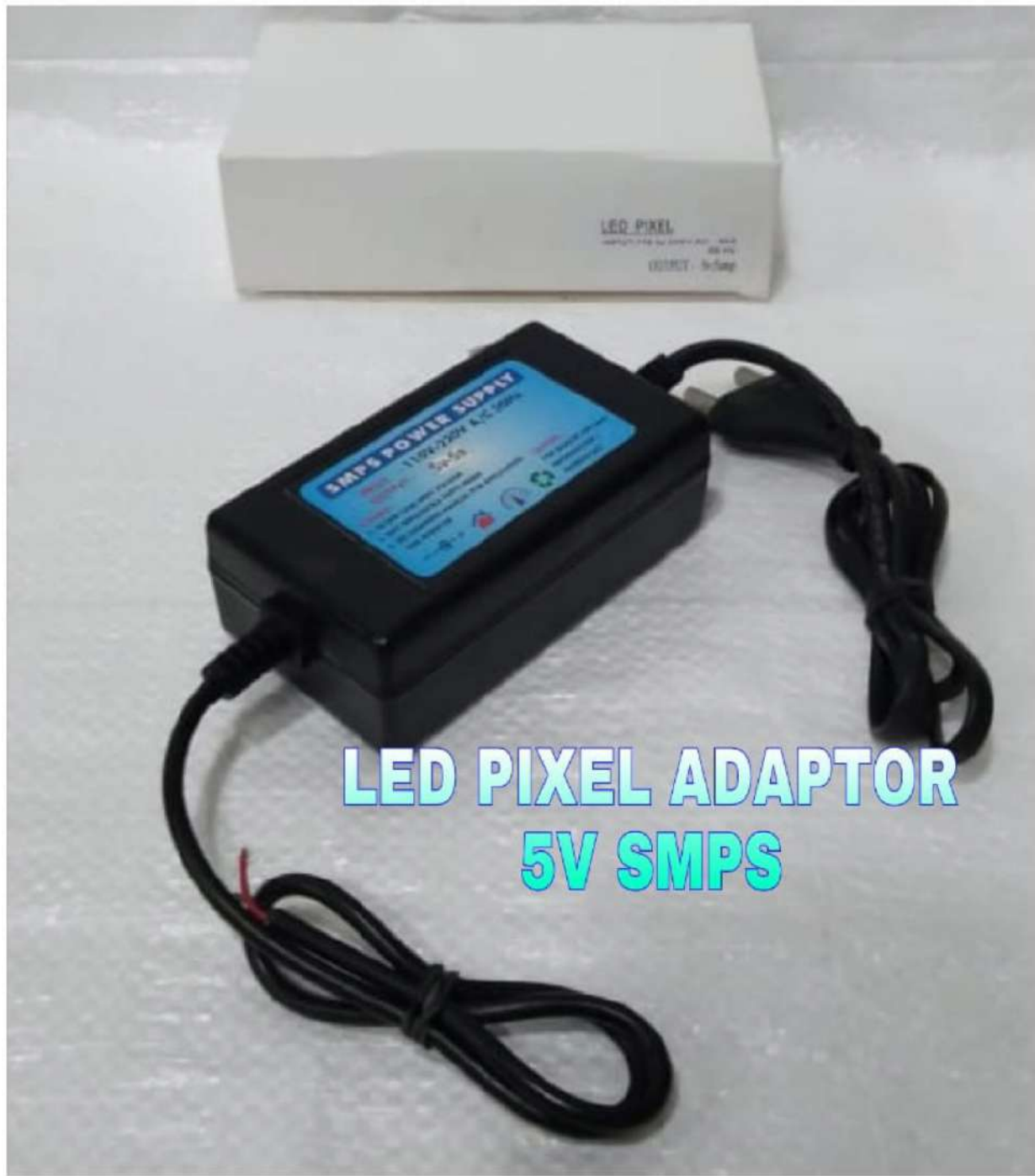
LED PIXEL ADAPTOR 5V SMPS