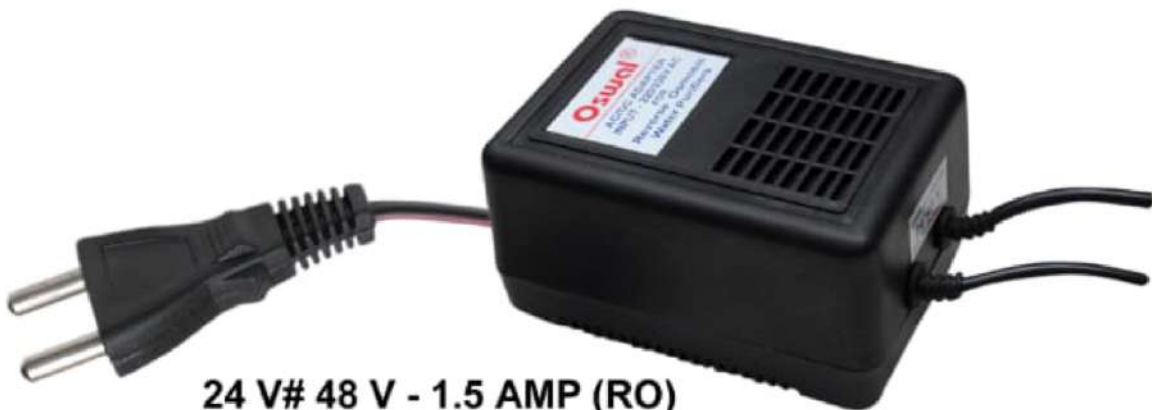
24 V# 48 V - 1.5 AMP (RO) 24 V# 36 V - 1.5 AMP (RO)