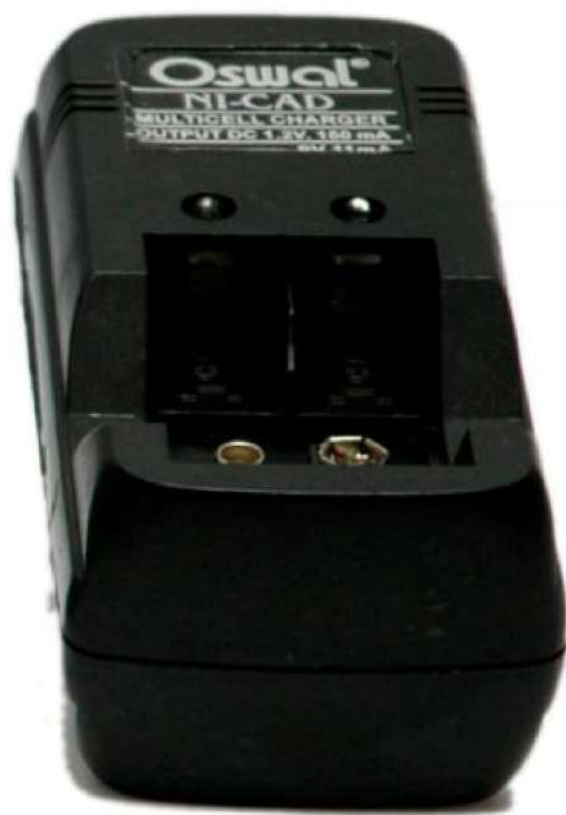
MULTI CELL CHARGER