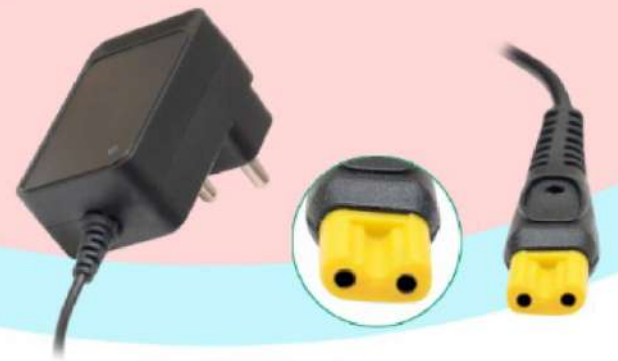
8V. - 100MA. FOR PHILIPS