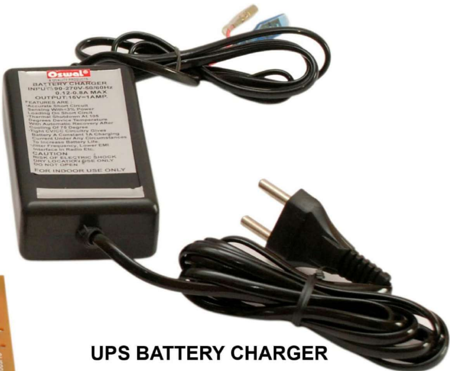
UPS BATTERY CHARGER