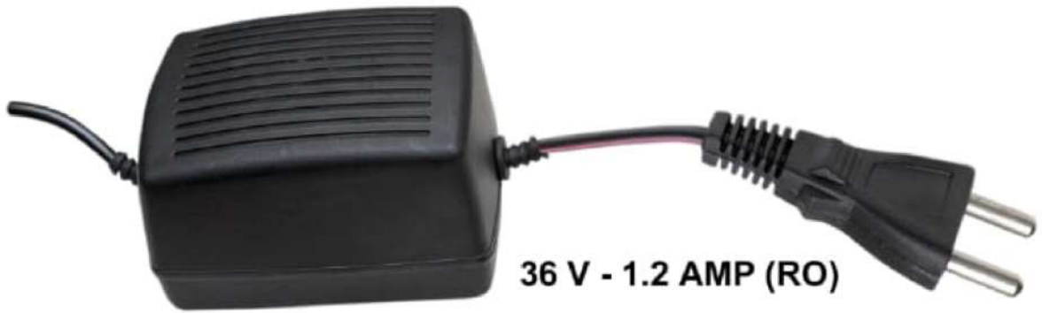
36 V - 1.2 AMP (RO)