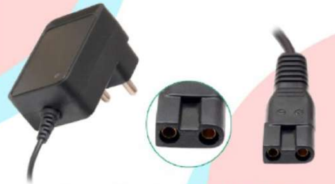
1.2V. - 1.0AMP. FOR PANASONIC