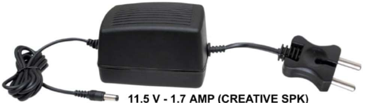
11.5 V - 1.7 AMP (CREATIVE SPK)