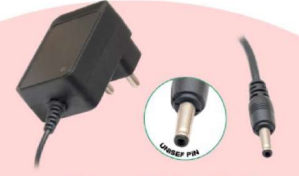
8V. - 100MA. FOR PHILIPS