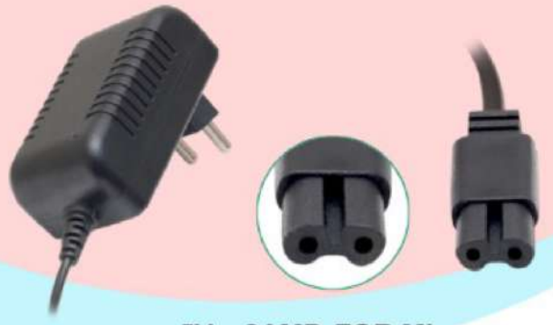
5V. - 2AMP. FOR MI