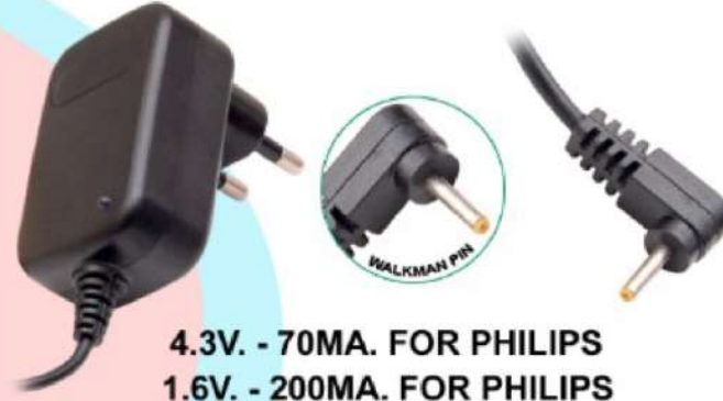
4.3V. - 70MA. FOR PHILIPS 1.6V. - 200MA. FOR PHILIPS